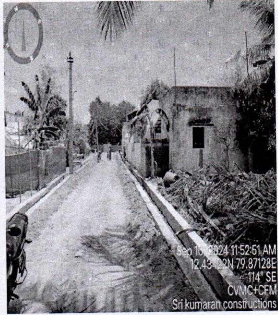
REAR SIDE VIEW