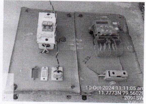
EB METER VIEW