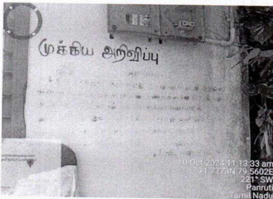
NAME BOARD VIEW