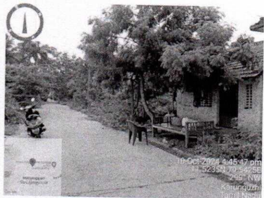
ROAD VIEW 2