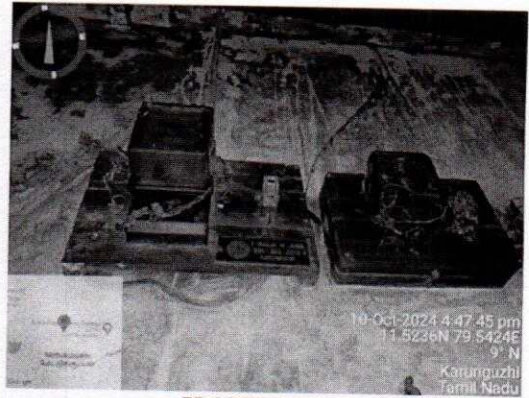
EB METER VIEW