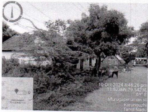
ROAD VIEW 1